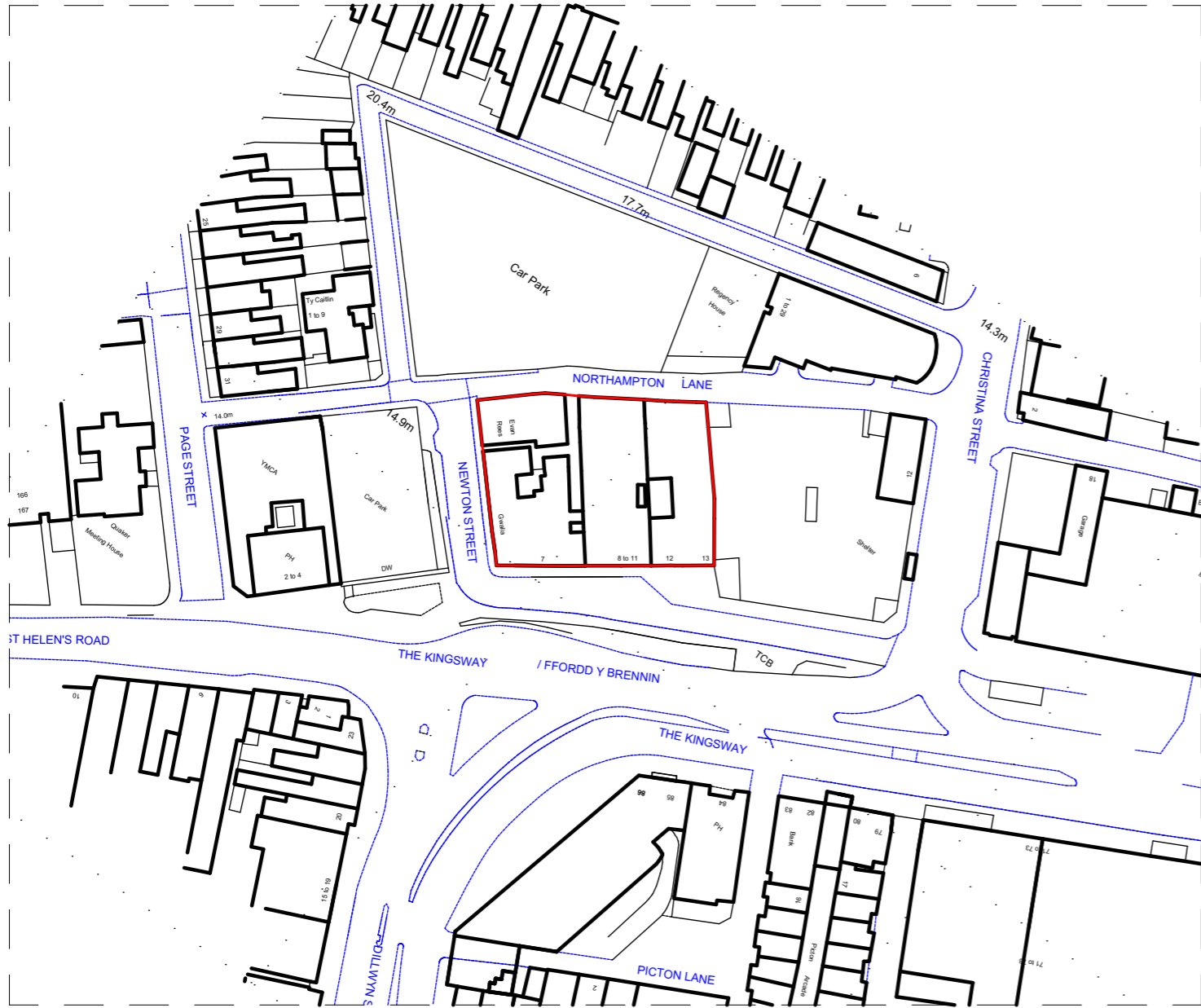
OS Promap 1:1250